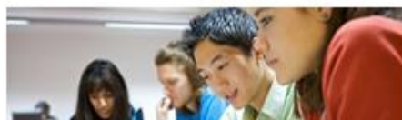
Cambridge English Exams