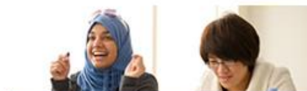
Full-time English Study

The English Language Teaching Unit offers a wide range of English Language and Study Skills courses to students who are studying at, or who want to study at, the University of Leicester.