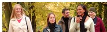
Erasmus and Study Abroad